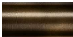
age brass (waxed)